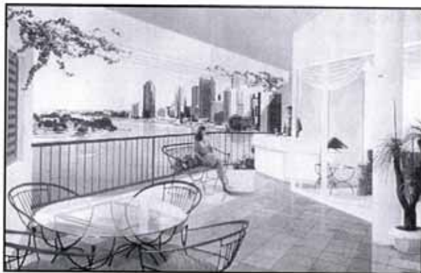
Quay Terraces will feature Mediterranean style apartments with large terraces.

Designed by Brisbane-based Greenway Architects and developed by Woolwich Pty Ltd — a group of local and interstate property developers, the project is being marketed by PRD Realty.