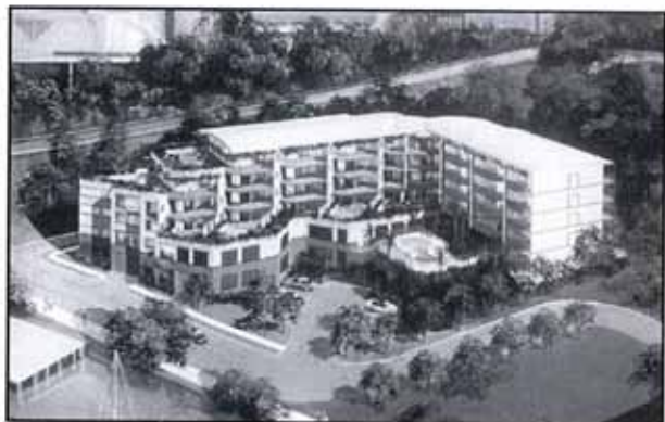
The five level Quay Terraces ... will offer contemporary riverfront living.