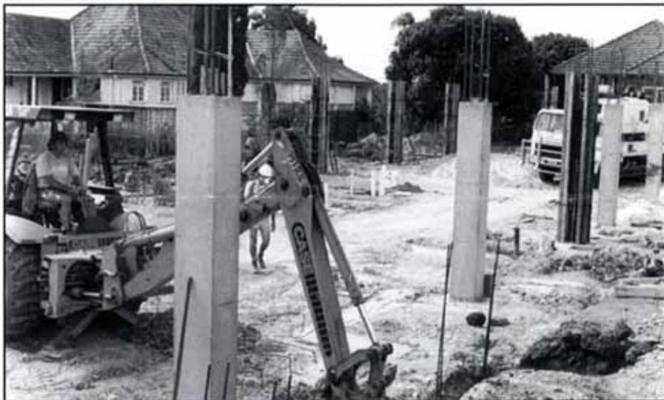
The Churchie contract involves four different sections, with the main section being a new multi-purpose block.