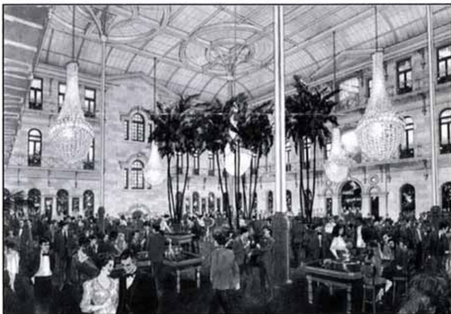
An artist's impression of the Treasury Casino Project...specialised demolition and timber work underway.

IT'S great to be part of the new Brisbane Treasury Casino Development, albeit a small part.