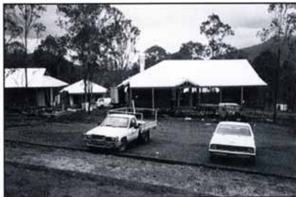
Lake Moogerah ... new Education Retreat soon to be completed.

CONTRACTS recently won by Hutchinsons, but not commenced are Brisbane Arcade Refurbishment, Toombul Railway Station Lift Installation, and Extensions to Dulux Paints.